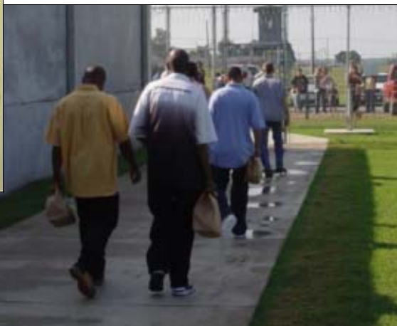
Below: No longer wearing their olive green uniforms, graduates walk out the Boot Camp gate to head home.