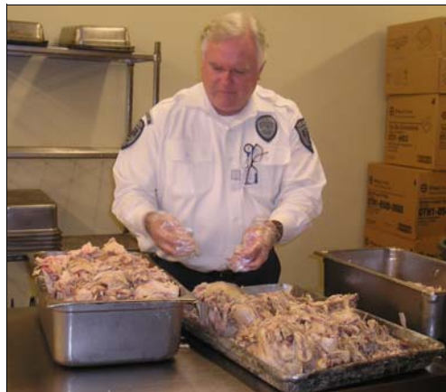
Above: Turkey meat is stripped from the bird and made ready to serve.