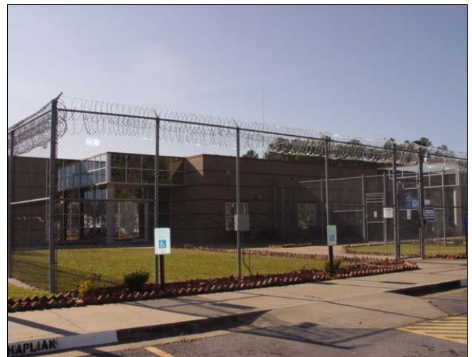
Above: The state is purchasing the 106-bed former Jefferson County Jail under a five-year agreement.

The jail has 58 single-man cells and 12 four-man cells. The single-man cells