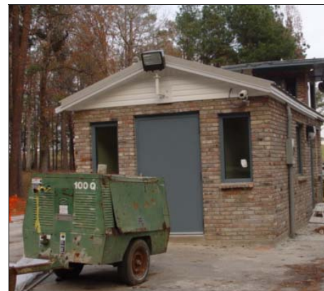
Left: The Pine Bluff Complex is getting a new gatehouse at its entrance. New visitor restrooms have also been added at the park across from the former jail.