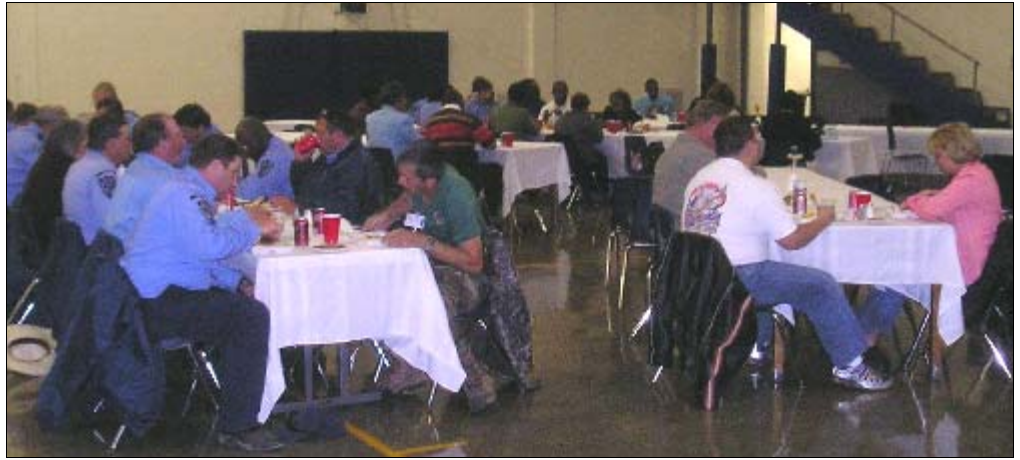
Above: Tucker Unit staff members gather for their Employee Awards Dinner.