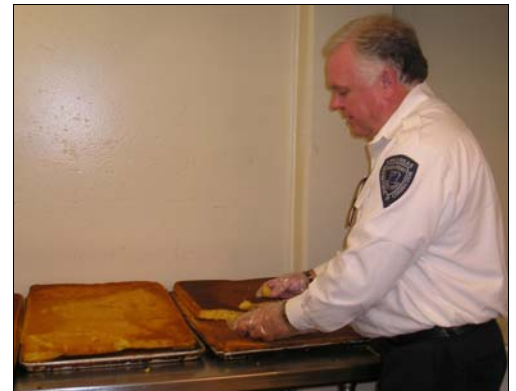
Above: cornbread is prepared to make 32 pans of dressing.