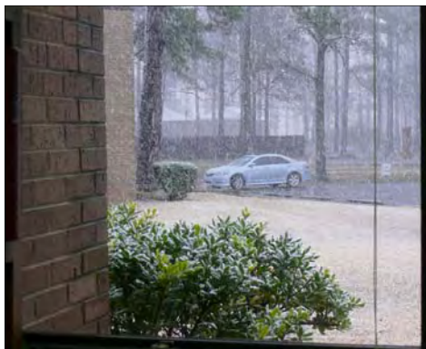
Above: A view of snow falling March 4 at ADC's Central Office. It was gone by the end of the day.