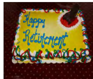
Right: the retirement cake sports a rocking chair.