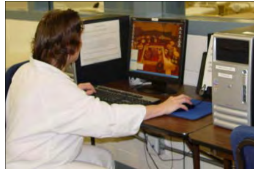
Left: An IFI program participant learns computer skills which will hopefully help her find work upon release.

The goal is to help the former inmates get settled