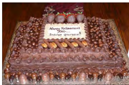
The cake's retirement message: Indulge yourself.