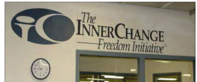
Above: A sign identifies the IFI barracks at the Hawkins Center at Wrightsville.

in a job, in the community, and in a supportive church or fellowship.