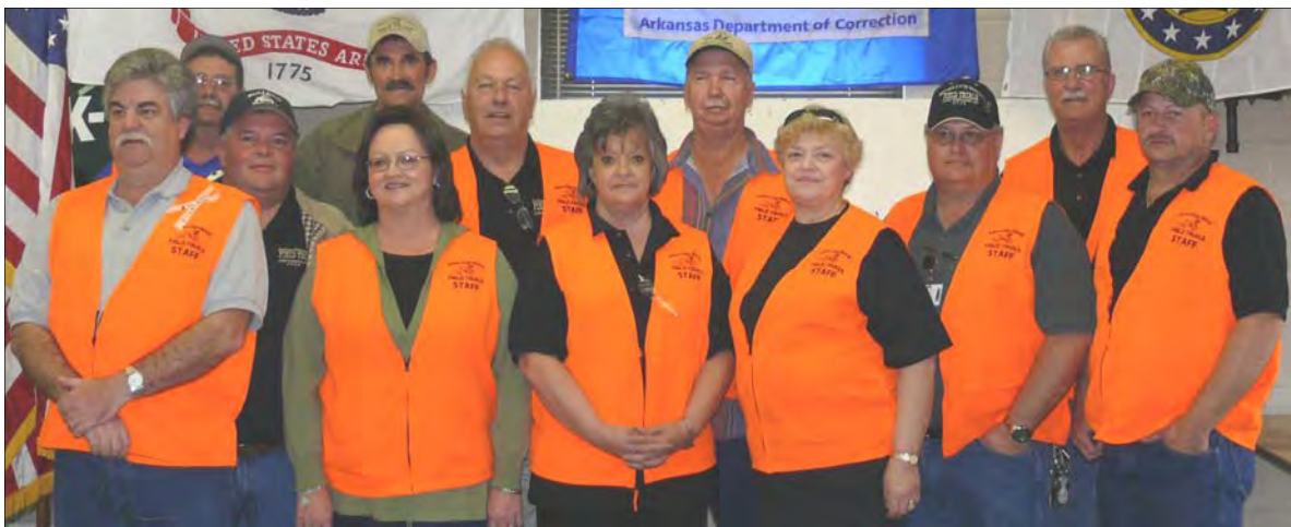
SSMFT Board members and staff work hard to organize the dog trials each year.