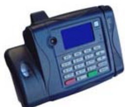
This device is used to record fingerprints for entrance monitoring at ADC units.