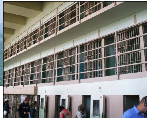
Below: Cell blocks at Alcatraz, the former federal prison which became known as “The Rock.”