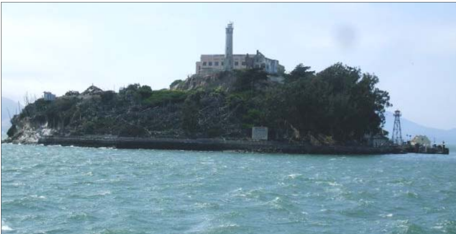
Above: Four ADC Honor Guard members recently had the opportunity to visit Alcatraz Island — the site of the first lighthouse and U.S fort on the West Coast and the infamous federal penitentiary.