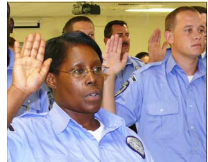
Above: Members of the BCOT class take the officer’s oath.