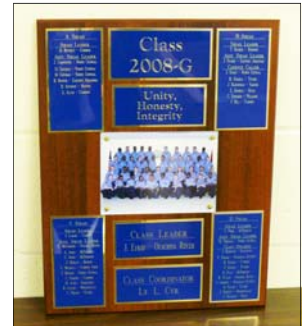
Right: The BCOT Class 2008-G plaque with their motto: “Unity, Honesty, Integrity.”