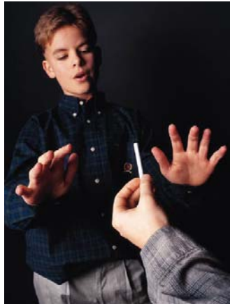
Smoking has dropped among youth and adults in Arkansas.